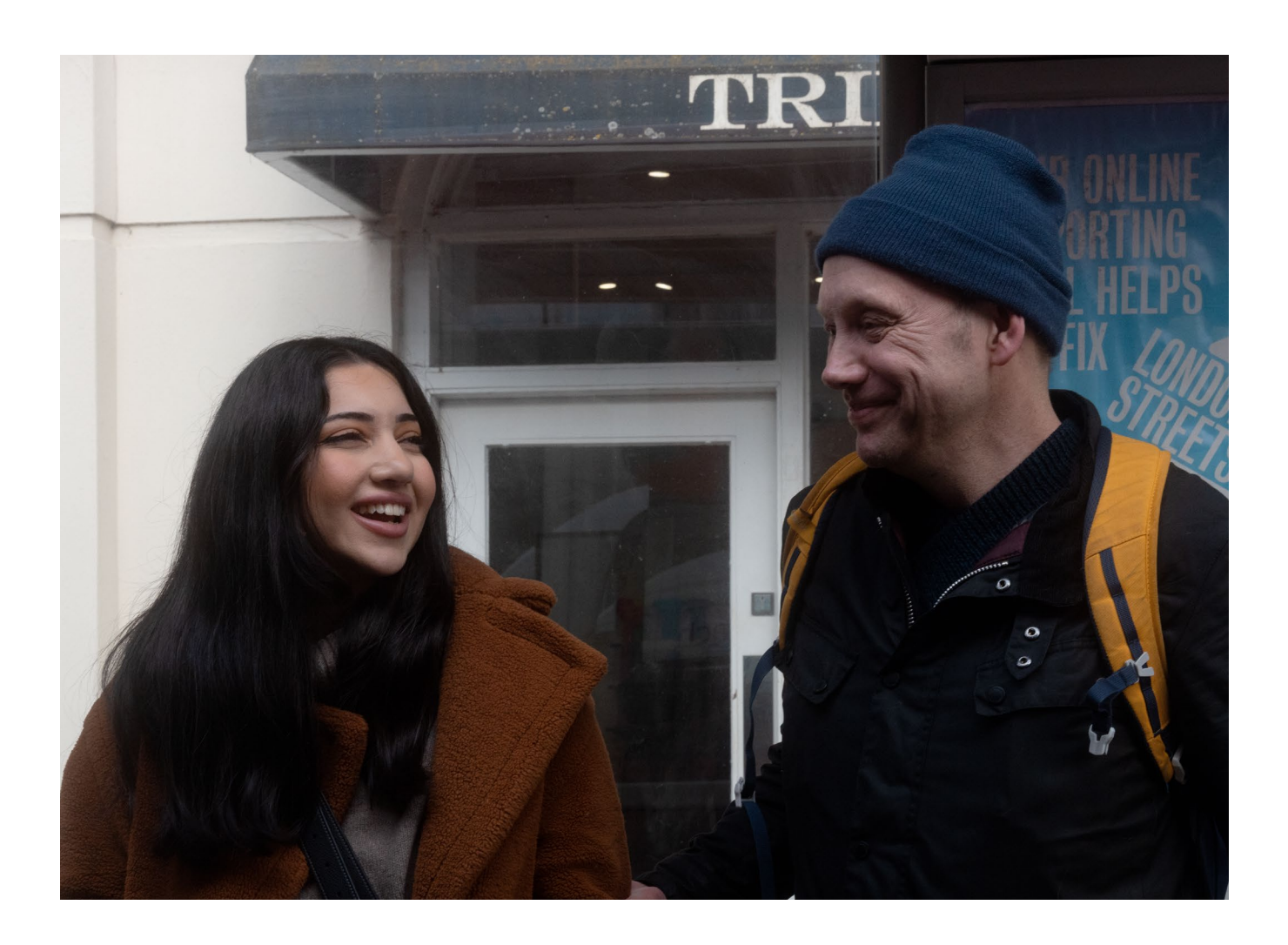
Say hello and introduce yourself – a bit of chat makes it less awkward.