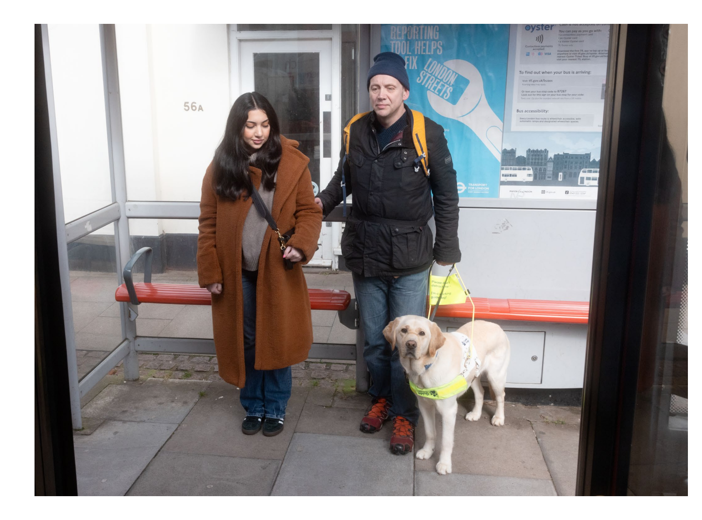
If someone wants to be guided, ask how they'd like it to happen and follow their lead. Please don't touch or grab their arm without asking – it can be quite unsettling!