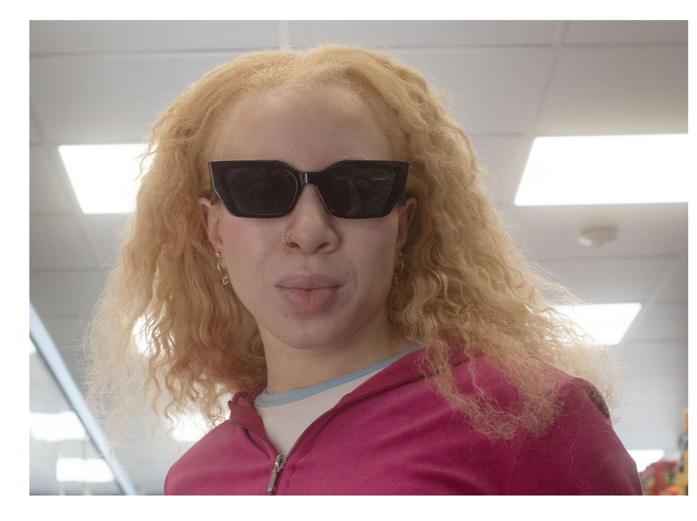
Or wearing dark glasses if they're sensitive to light