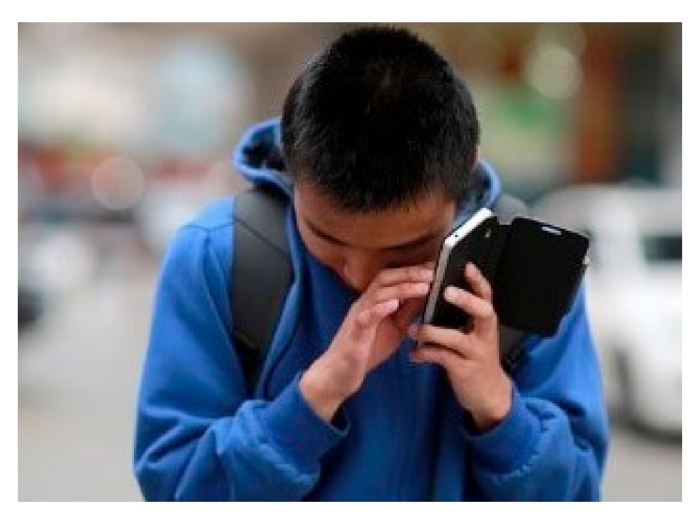
Someone holding their phone close to their face