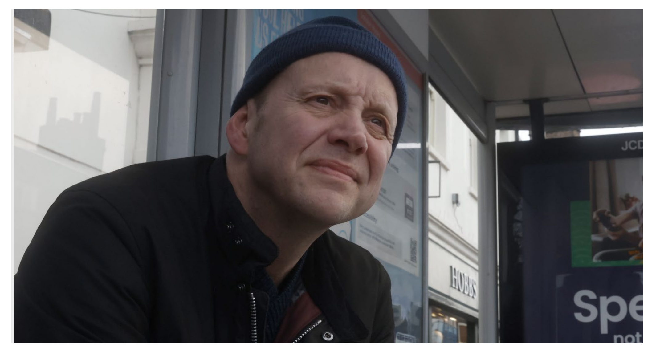
When you get to the destination, explain where things are so they know what to do next. And please, please – say goodbye when you're leaving so they don't keep talking to you. Not a great look.