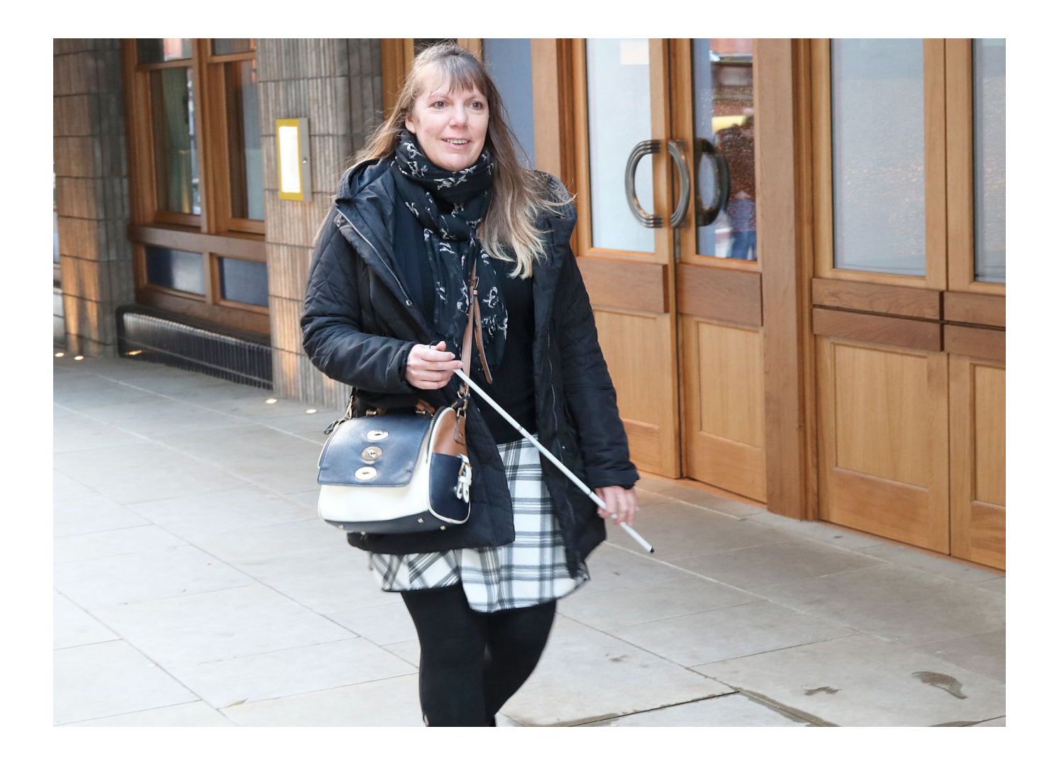
Someone holding a shorter cane while walking (this is called a symbol cane)