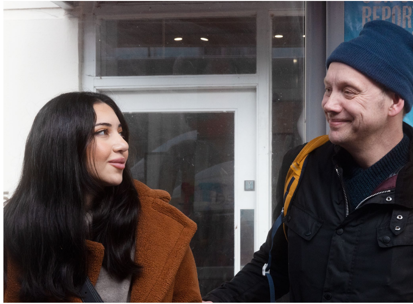
Ask if the person would like some help, and what you can do, like help them find the bus door. Don't be offended if you get a 'no thanks'!